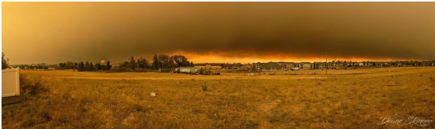
North Cheyenne Neighborhood