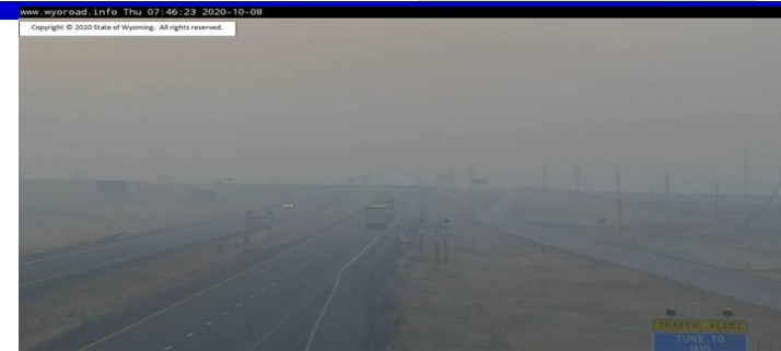
WyDOT Image on I-80